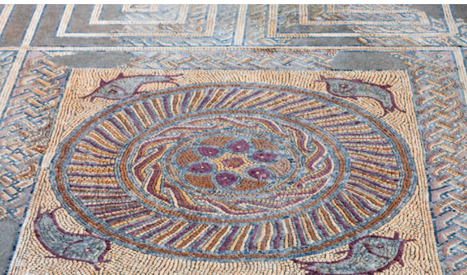
Mosaic from Portugal's ancient Roman site of Conimbriga