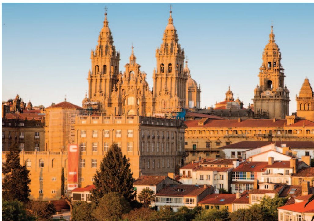
Catedral de Santiago de Compostela, Spain