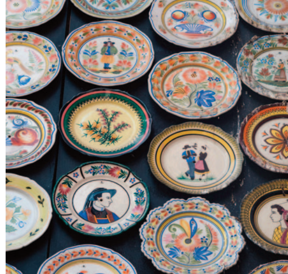
Faïences de Quimper pottery from Brittany