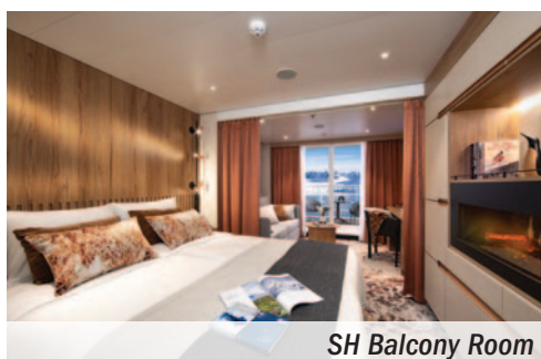
SH Balcony Room