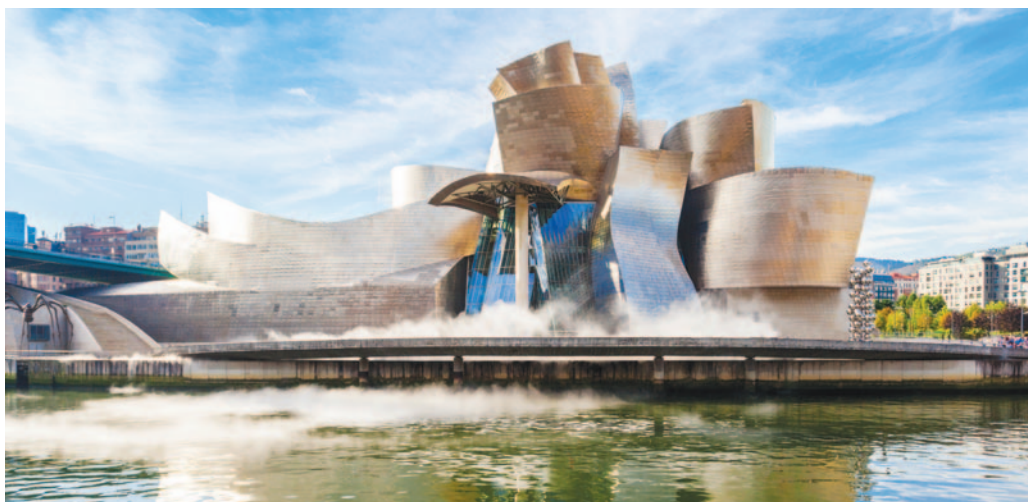
The Guggenheim Museum, Bilbao