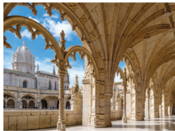
Jerónimos Monastery, Lisbon