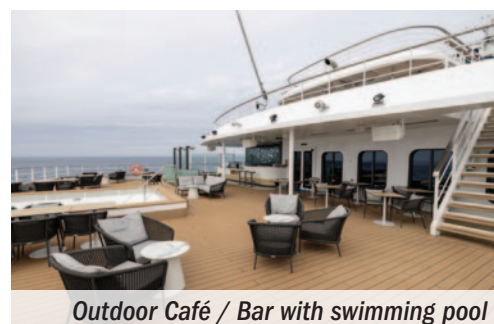
Outdoor Café / Bar with swimming pool

Currently under construction in Finland and launching in early March 2023, Swan Hellenic's Diana is a new-generation expedition cruise ship. Although at 12,100 tons the ship is large enough to accommodate more than 350 passengers, Diana will accommodate a maximum of 192 guests in 96 spacious staterooms and balcony suites. The low guest density results in one of the most generous indoor and outdoor space-to-guest ratios among cruise ships.