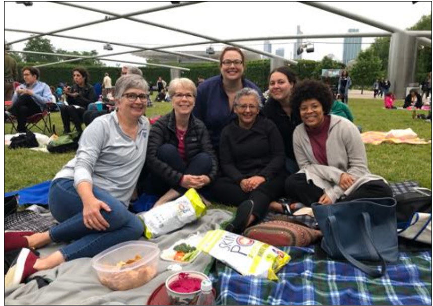
Photo of the Summer Concert in Millennium Park

Alumnae and guests shared picnics on the lawn at Millennium Park while enjoying an eclectic evening of music on June 17th. Featured were Cory Henry and the Funk Apostles for a blend of blues, soul, R&B, Afrobeat, gospel and jazz, and Liniker e os Caramelows, combining soul and R&B with the tropical heritage of Brazilian music.