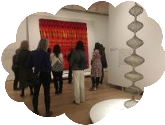
Friends of Art Members visit the exhibit "In a Cloud, in a Wall, in a Chair: Six Modernists in Mexico at Midcentury"