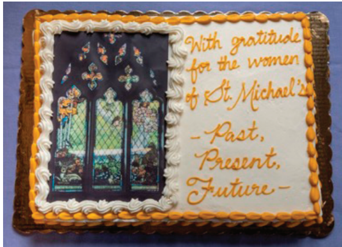
Refreshment at the Reception