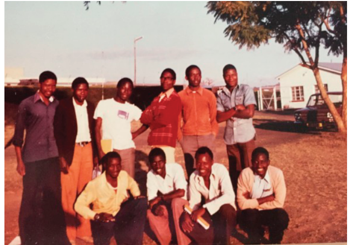
My Automobile Mechanics