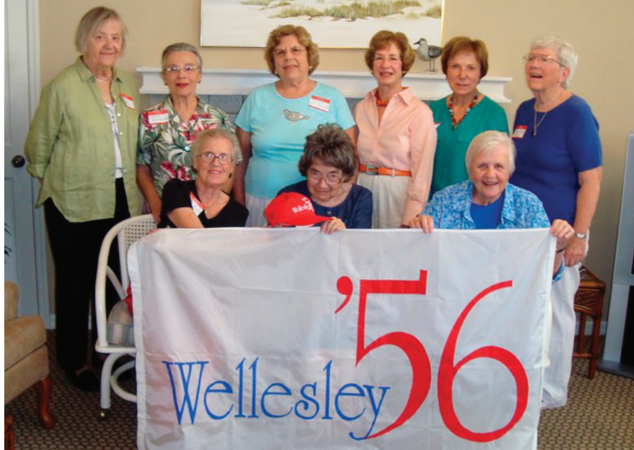
Sarasota, Florida, Wellesley Club