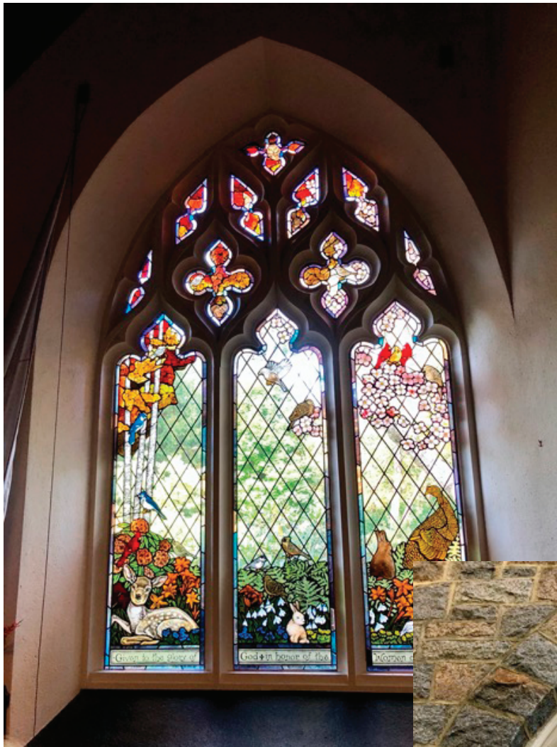
Window from Inside and Outside