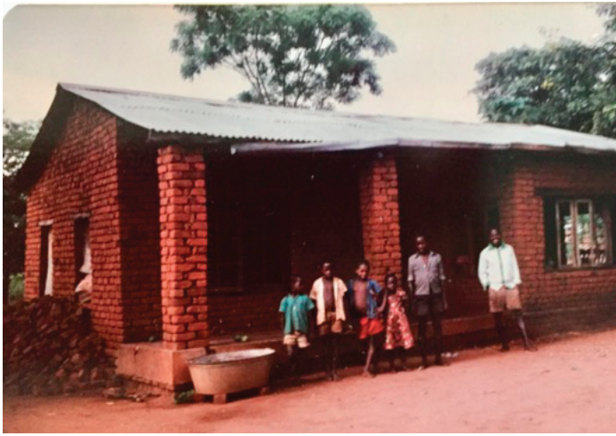
Reginald's Aunt's House